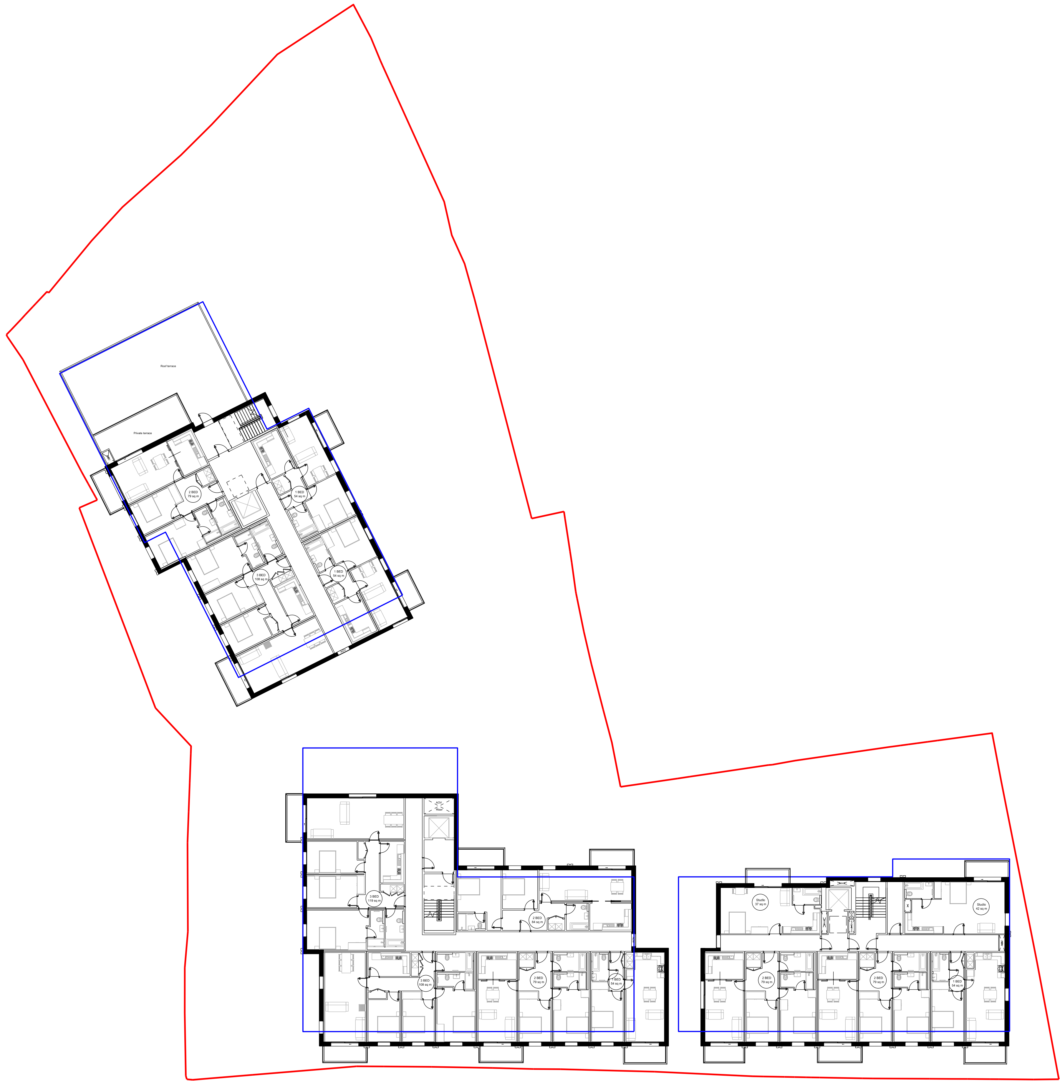
1 Proposed - Fourth Floor Plan Scale: 1 : 200