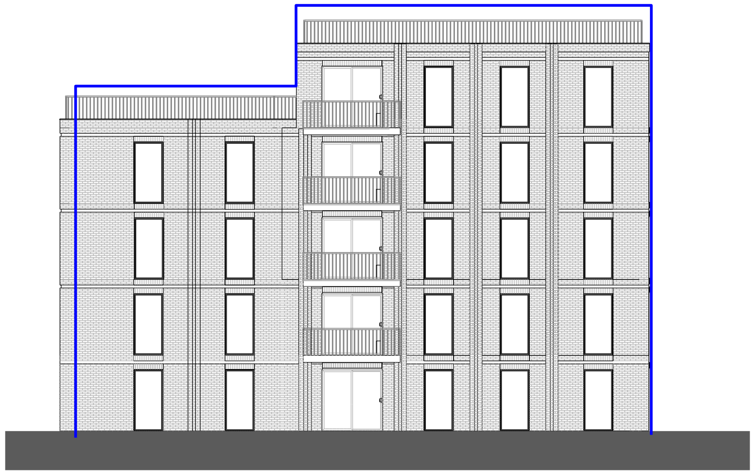
2 Elevation F-F Scale: 1 : 150