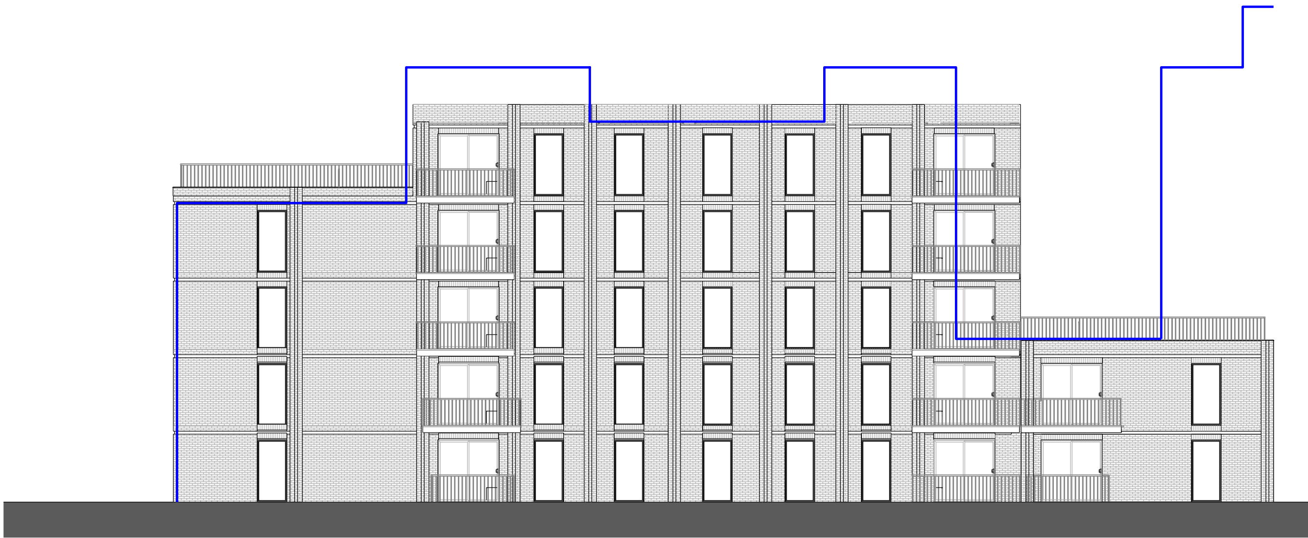
2 Elevation D-D Scale: 1 : 150