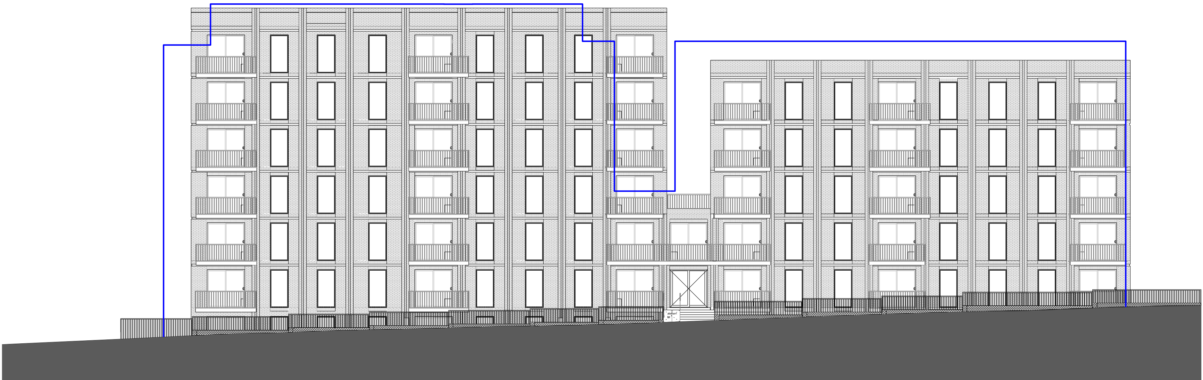
1 Elevation A-A Golders Green Road Scale: 1 : 150