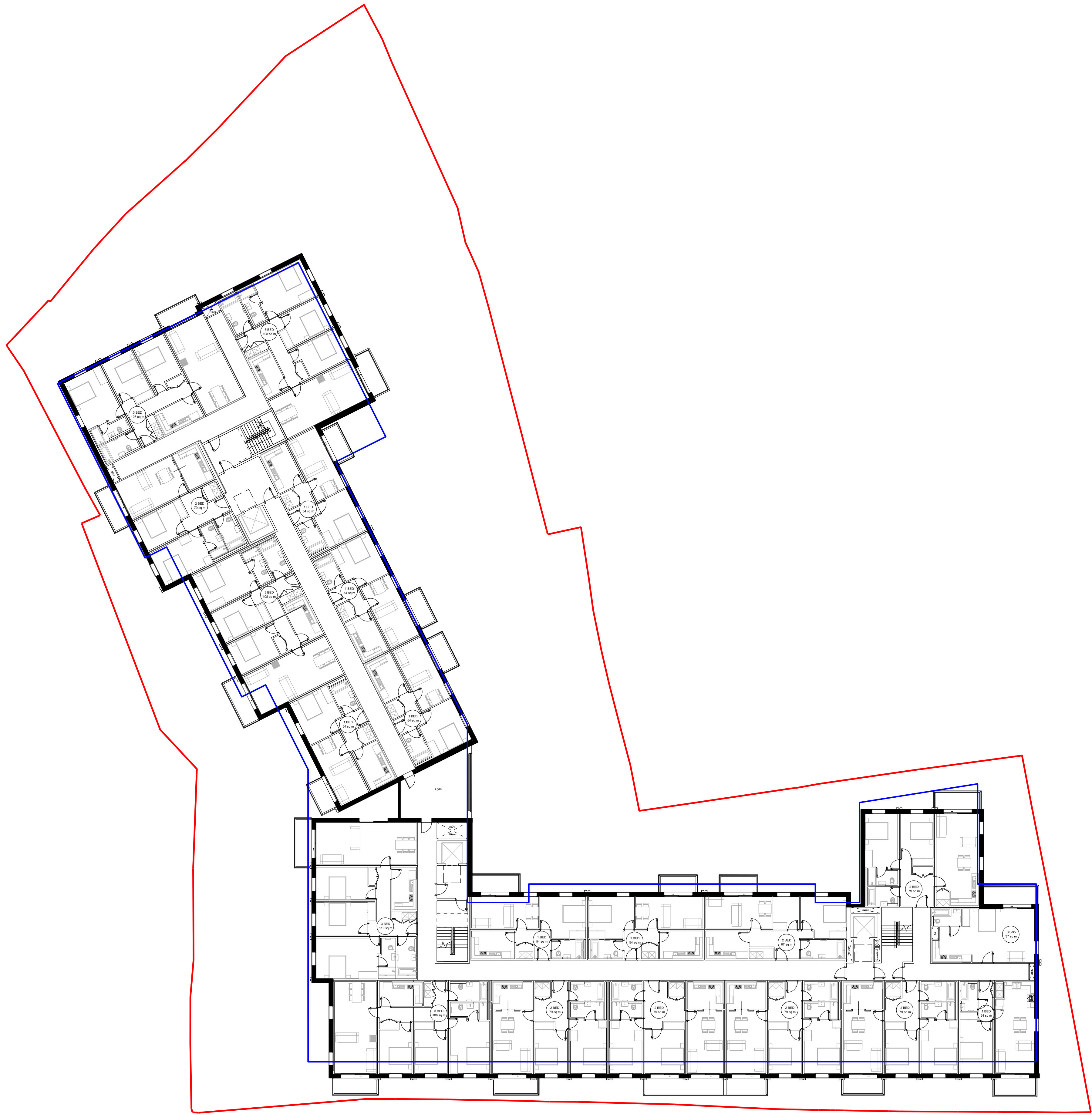
1 Proposed - First Floor Plan Scale: 1 : 200